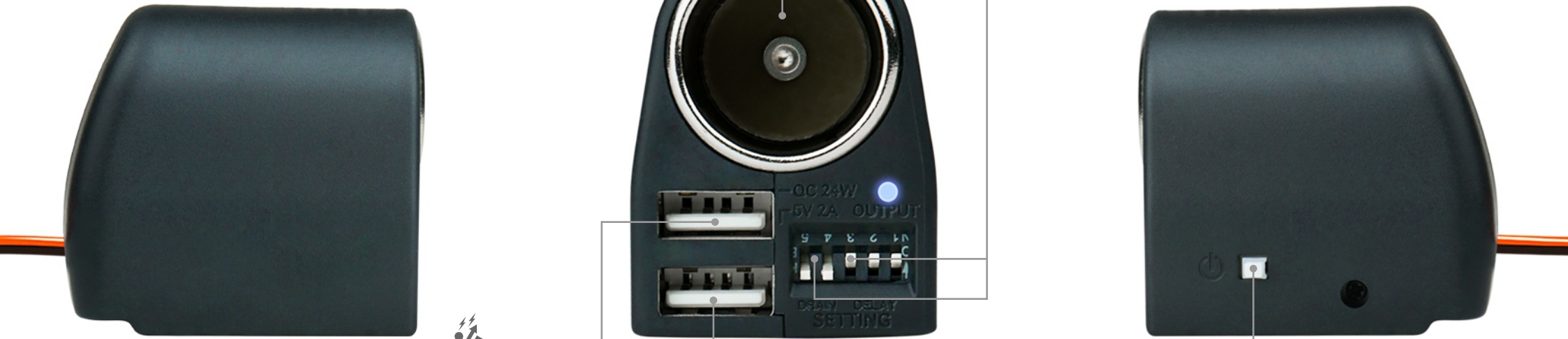
[POWER BUTTON] ◀